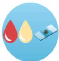
Baseline Profiling Blood, Urine, or Tissue