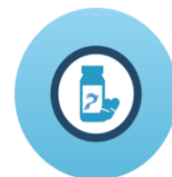
Actionable MRD 500 actionable mutations