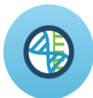
Multi-Dimensional MRD Detection Mutations, Fusions, and Copy Number Changes