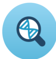
Ultra Sensitivity 0.005% Limit of Detection